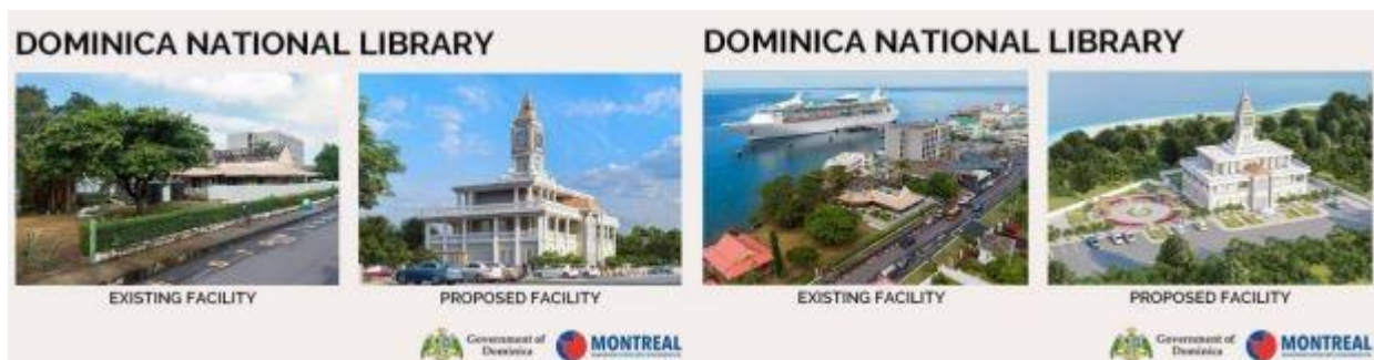
Artist impression of proposed library

In April 1905, the Legislative Council having passed a resolution accepting Carnegie's offer and his terms. One year later in April 1906, the Carnegie Library (as it was called) was completed. In September of that same year, the library was transferred to the new building, and the Victoria Memorial Library was taken over as the Victoria Memorial Museum. The Carnegie Library was formally opened to the public as a subscription library from 8 a.m. to 5 p.m. daily. Although the words "Free Library" were inscribed on the building, the library was free only to the extent that anyone could come in to use the reading room. But only subscribers had borrowing privileges. At that time, the collection consisted mainly of newspapers and periodicals. In 1940, with the implementation of a project aimed at setting up a regional library, Dominica received books for setting up a demonstration library. As a result, for a time Dominicans could borrow books free. In 1954 Government took over the administration of the library under the Public Library Act No. 11 of 1954.