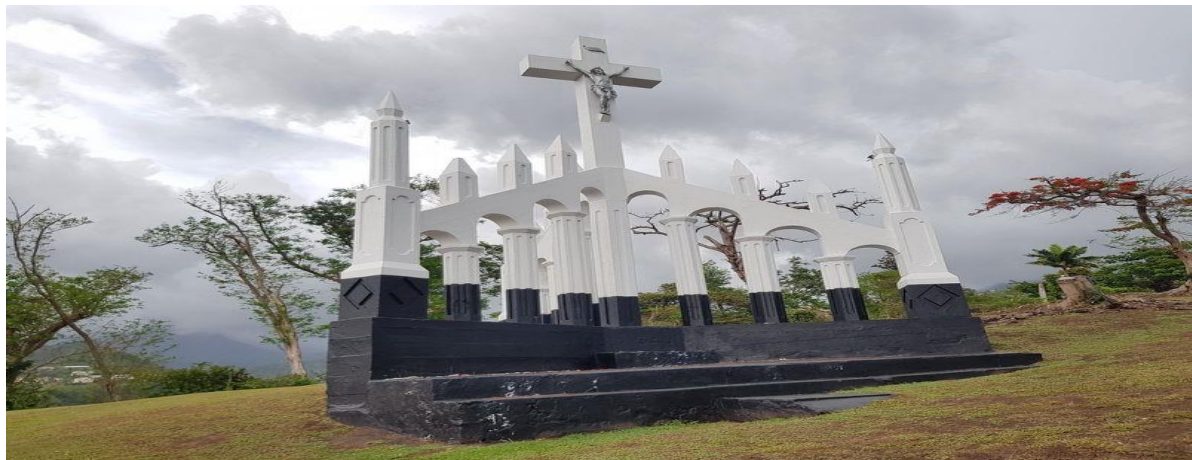
Photographed By J. Makali Bruton, June 9, 2019

measured in a direct line); David the Goliath (approx. 0.4 kilometers away); Roseau Cathedral (approx. 0.7 kilometers away); Methodist Church (approx. 0.7 kilometers away); Anglican Church (approx. 0.8 kilometers away); Carnegie Library of Roseau (approx. 0.8 kilometers away); World Wars Memorial (approx. 0.8 kilometers away); Cecil E. A. Rawle (approx. 0.8 kilometers away). Touch for a list and map of all markers in Roseau.