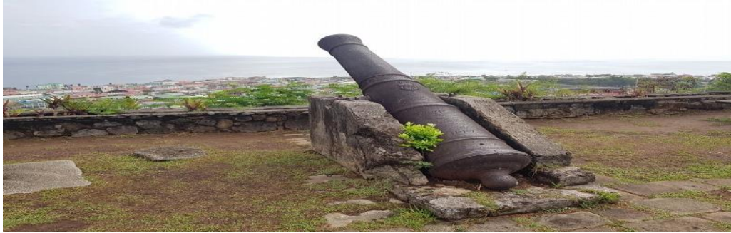
June 9, 2019

Other nearby markers. At least 8 other markers are within walking distance of this marker. A different marker also named Morne Bruce Garrison (about 150 meters away,