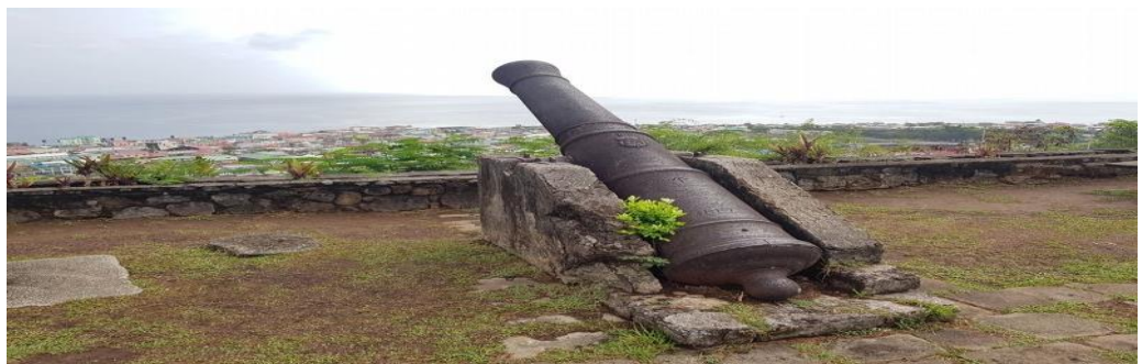
4. Morne Bruce Garrison cannon

Other nearby markers. At least 8 other markers are within walking distance of this marker. A different marker also named <u>Morne Bruce Garrison</u> (about 150 meters away,