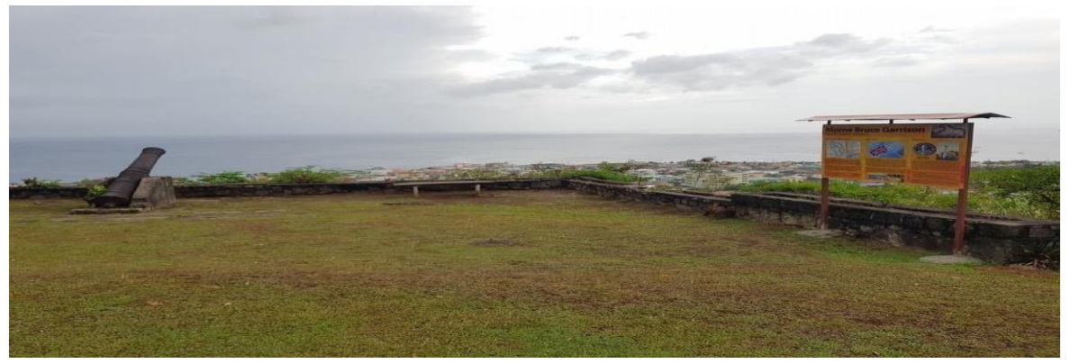
Photographed By J. Makali Bruton, June 9, 2019 2. Morne Bruce Garrison Marker

The signal cannon mounted on this site was made in England of cast iron. The figures marked on the cannon: 51-1-7 represents the weight in old English measures: 51 hundredweights, 1 quarter, 7 pounds. The cannon therefore weighs (51x112 lbs.) + (1=28 lbs.) + 7 lbs. = 5,747 lbs.