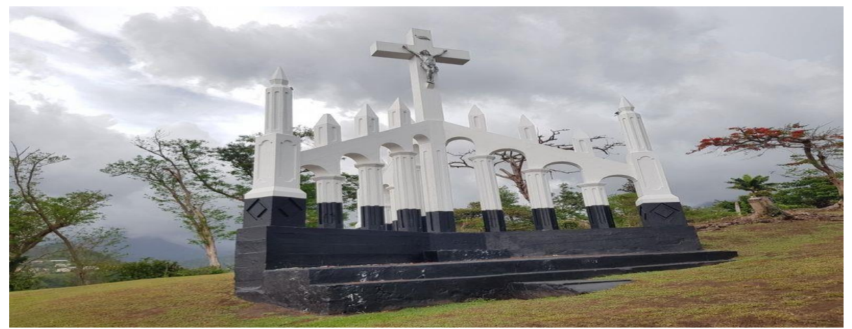
Photographed By J. Makali Bruton, June 9, 2019 5. 'The Shrine' at Morne Bruce

measured in a direct line); <u>David the Goliath</u> (approx. 0.4 kilometers away); <u>Roseau Cathedral</u> (approx. 0.7 kilometers away); <u>Methodist Church</u> (approx. 0.7 kilometers away); <u>Anglican Church</u> (approx. 0.8 kilometers away); <u>Carnegie Library of Roseau</u> (approx. 0.8 kilometers away); <u>World Wars</u> <u>Memorial</u> (approx. 0.8 kilometers away); <u>Cecil E. A. Rawle</u> (approx. 0.8 kilometers away). <u>Touch for a list and map</u> of all markers in Roseau.